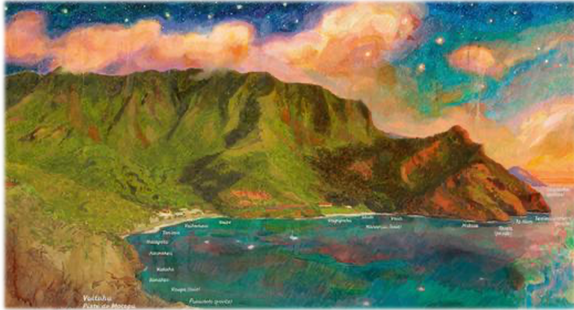
Titouan Lamazou - Baie de Taihoa'e, Nuku Hiva, îles Marquises Titouan Lamazou - Taihoa'e Bay, Nuku Hiva, Marquesas Islands